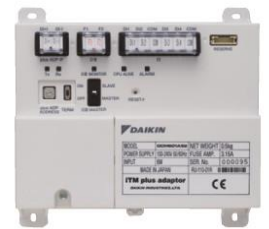
iTM Plus Adaptor (Optional)